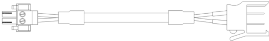
Figure 516 Layout of the FS-PDC-MB24-y power distribution cable

Figure 516 on page 814 shows the layout of the FS-PDC-MB24-y power distribution cable.