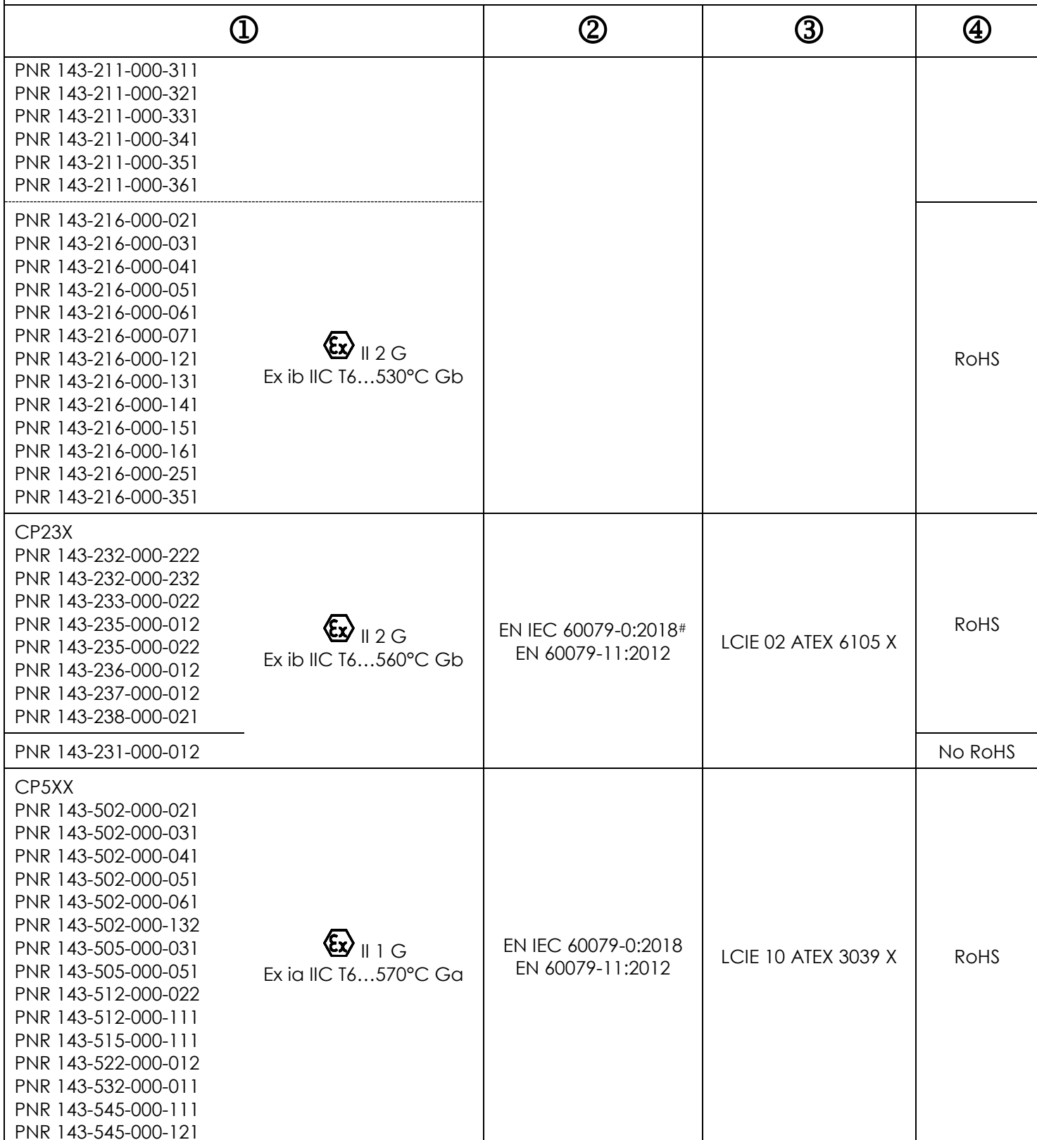
Tableau A Table A