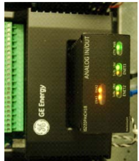
Typical I/O Module with Box-type Terminal Block

Every I/O pack communicates directly over the IONet, which enables each I/O pack to be replaced individually without affecting other I/O packs in the system. Additionally, the I/O pack may be replaced without disconnecting any field wiring.